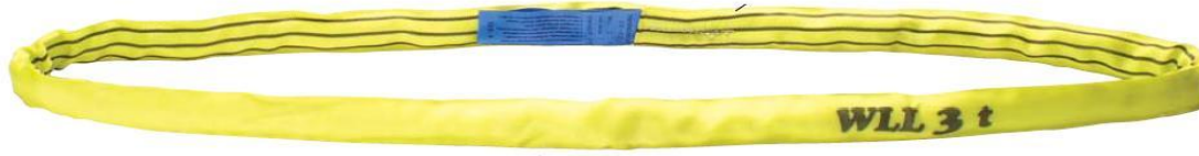
Uniform colour coding for the WLL